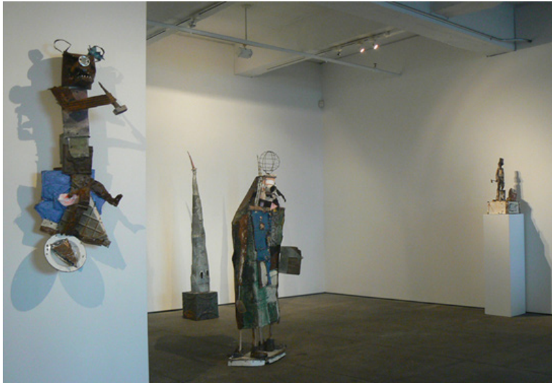
Exhibition view Picklelilly