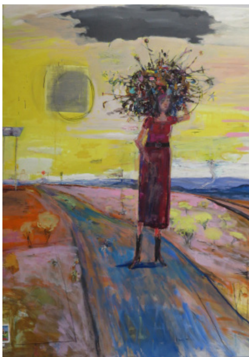
Here, 2015 Oil and collage on canvas, 194,5 x 148,5 cm