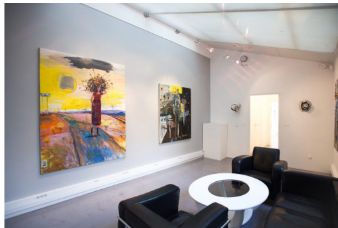
Exhibition views Une certaine vision de l'Amérique