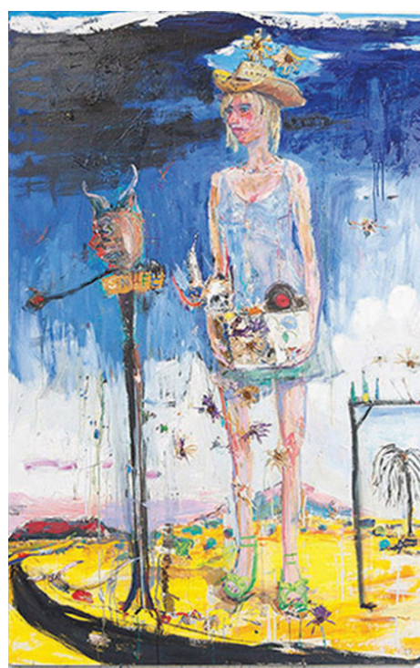
Lucinda, 2014 Oil and collage on canvas, 157,5 x 101,8 cm