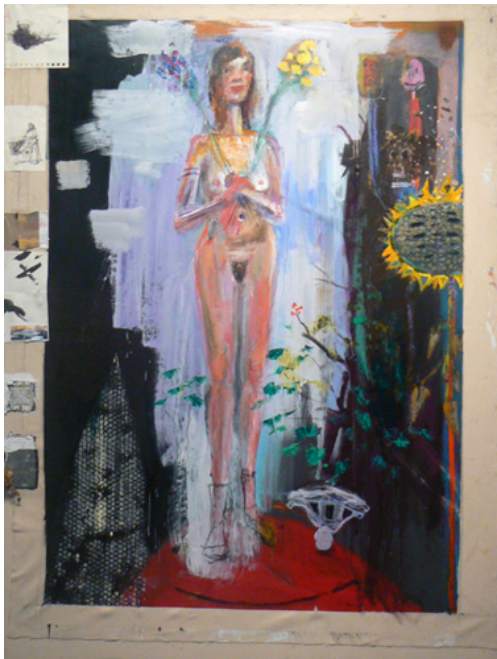
Bear and Pie , 2011, Mixed medias, 86.36 x 38.1 x 43.18 cm