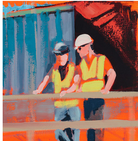
Workers 2 , 2016, Oil and acrylic on canvas, 5,8 x 30,48 cm