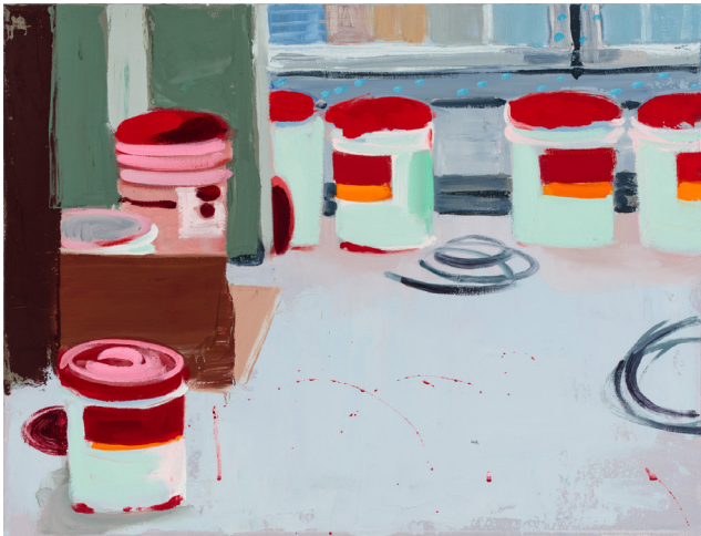
Seven Buckets , 2016, Oil on canvas, 35,6 x 45,7 cm