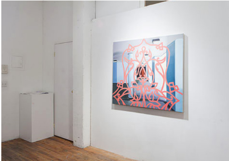
Exhibition view The Shirey, « Arabesques »

Exhibition, Brooklyn, New York, NY, 2014 The Shirey, « Arabesques »