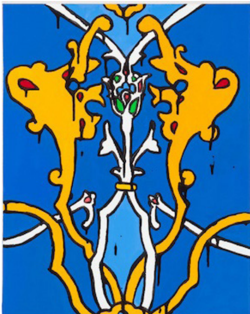
Detail of a work